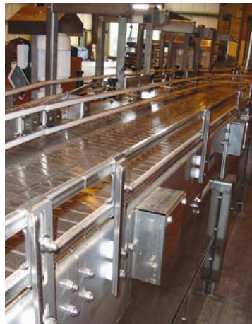
Bleach handling conveyors integrated with a Vision system to check product fills and cap closures

Pressureless combiners, Re-Flow and bi-directional accumulation tables, vertical and serpentine accumulators, alpine conveyor systems, gripper elevators, product reorienters, and merging and diverting conveyor systems are equipment products that Nercon has manufactured in the industry.