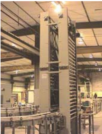
This first-in, last-out vertical accumulator is specially designed to handle tubed packages.

Nercon has engineered various types of equipment to handle a magnitude of package types within the Household/Chemical industry. Using chemical resistant properties for chain and conveyor components, Nercon has designed numerous systems for bleach, detergent and other corrosive wet or dry chemicals. Nercon has also engineered a number of systems handling the saturated wipe products such as for dusting or cleaning. Both stacks of wipes as well as the light containers have been conveyed in Nercon systems.