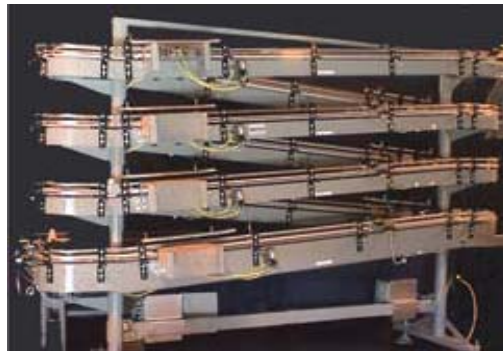
Household air fresheners are system accumulated on this alpine conveyor

Nercon has engineered air conveyor systems and stacking systems to handle tray products. Twist equipment has also been engineered to convey and twist stacks of the wipe products.